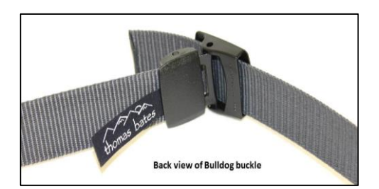
Back view, after threading the web through the buckle.